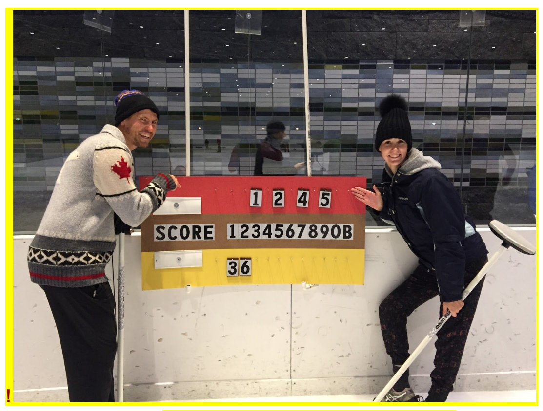
BABZ relishes a well played game