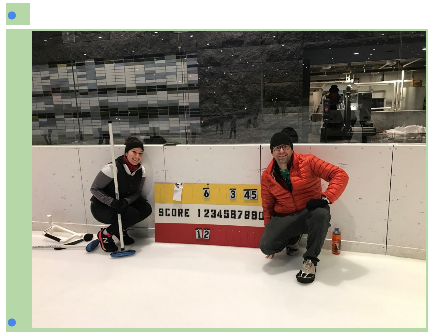
Blarney Stone Basks in the aftermath..... Six... count 'em..... SIX!