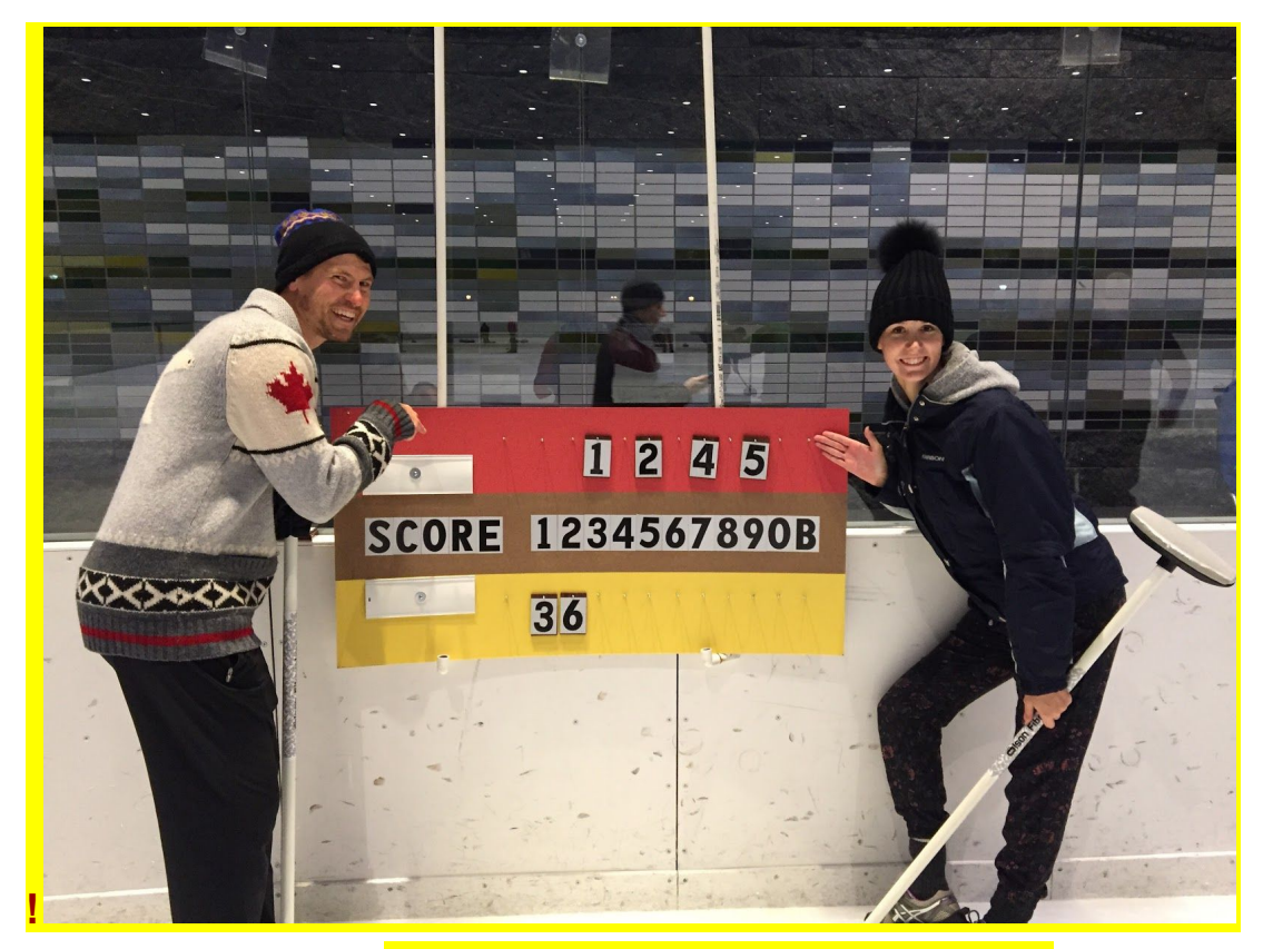
BABZ relishes a well played game